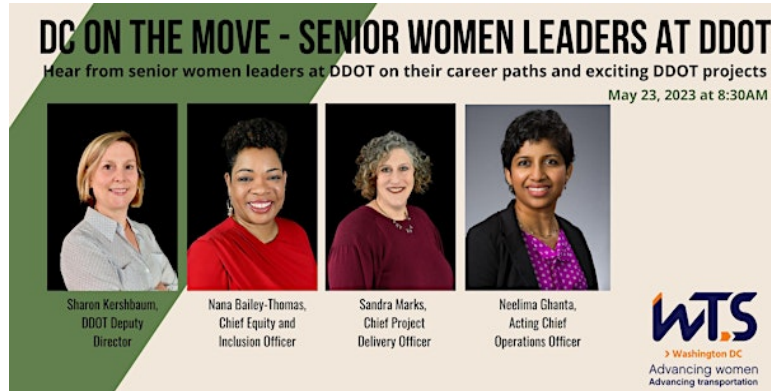
Photo 13. Panelists for the DDOT Event

On Tuesday, May 23, WTS-DC held its first official event with the District Department of Transportation (DDOT). The event featured an interactive panel with women leaders from DDOT on their career paths and new and exciting projects in sustainable transportation in DC. Speakers were: