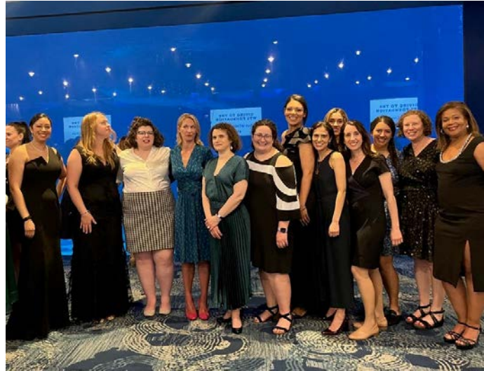
Photo 46. WTS-DC attendees at the WTS International Annual Conference Gala