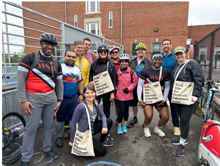
Photo 12. Participants in the 2023 Spring Bike Tour

On Sunday, April 29, 2023, WTS-DC held its annual spring bike tour, a 6.5-mile ride to learn about new bicycle and pedestrian infrastructure in Silver Spring, MD. The route was planned by bike facilities design specialists and enabled the 12 participants to experience first-hand how new bike and pedestrian facilities were implemented and how they operate.