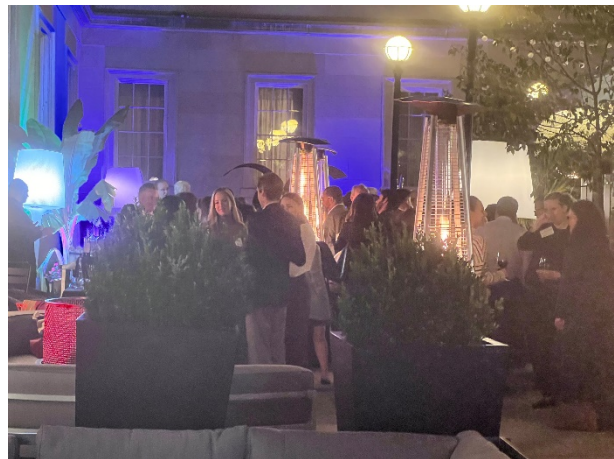
Photo 24. Guests enjoying the beautiful night