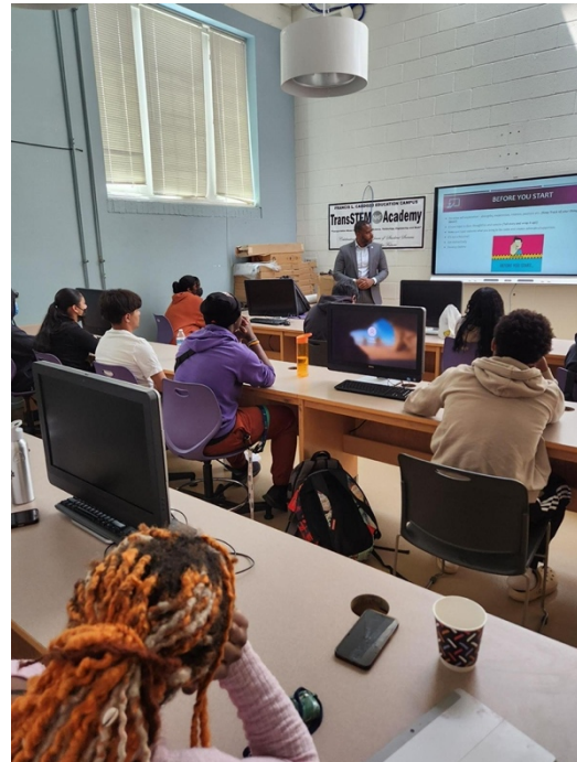
Photo 10. TransSTEM Academy

The following month, TYOU partnered with Cardozo High School's TransSTEM Academy to support juniors as they navigate the college application process. This event marks the fourth year Cardozo and TYOU have partnered to provide students with resources, experiences, and mentors in the transportation community. The TransSTEM Academy was established at Cardozo High School in 1991 and builds bridges between high school students and the transportation industry workforce.