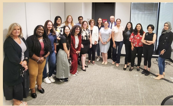
June Panel Discussion