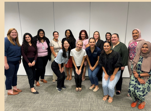
September Panel Discussion

By Sara Coffey, Pape-Dawson, Mentorship Committee