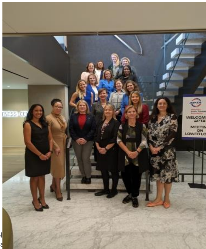
WTS DC 2023 Annual Report Photo 26. EWR participants

Participants switched topics each round to give them as many opportunities as possible. The conversations involved shared experiences and a