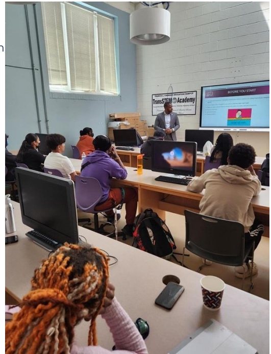
Photo 10. TransSTEM Academy