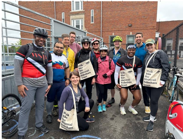
Photo 12. Participants in the 2023 Spring Bike Tour

On Sunday, April 29, 2023, WTS-DC held its annual spring bike tour, a 6.5-mile ride to learn about new bicycle and pedestrian infrastructure in Silver Spring, MD. The route was planned by bike facilities design specialists and enabled the 12 participants to experience first-hand how they operate.