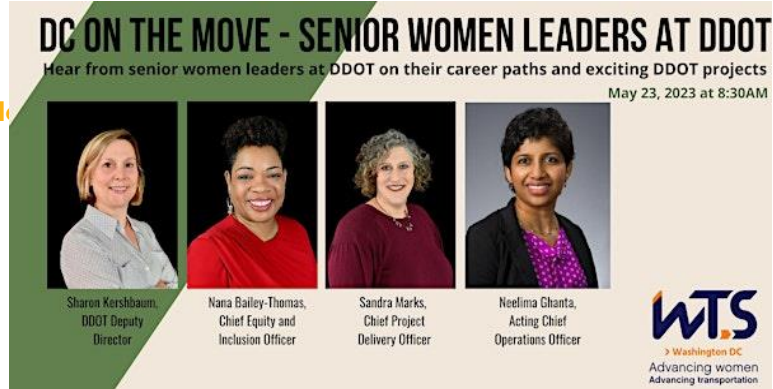
Photo 13. Panelists for the DDOT Event