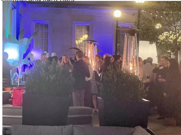
Photo 24. Guests enjoying the beautiful night